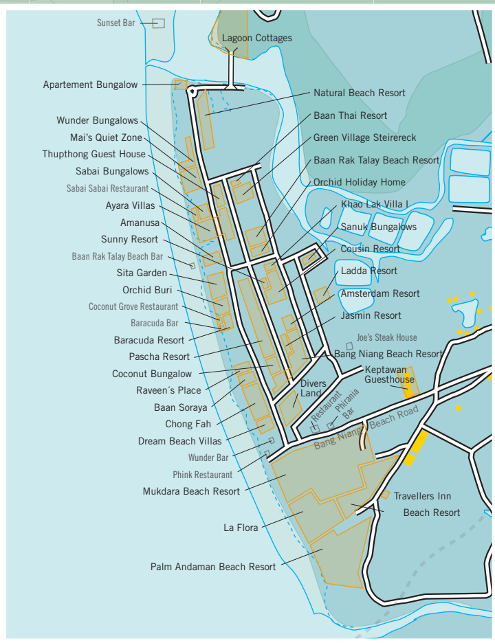
Inset 1, Bang Niang Beach

On the morning of December 26, at 7:58:53 (Khao Lak local time), an earthquake with a magnitude of about 9, occurred off the west coast of northern Sumatra, Indonesia. The epi-centre was beneath seabed at 3.32°N 95.85°E. The force of the earthquake generated tsunamis which subsequently swept across the Indian Ocean. At approximately 10 o'clock, the water receded from the beaches of Khao Lak. Twenty five minutes later the first wave hit the shores and swept inland.